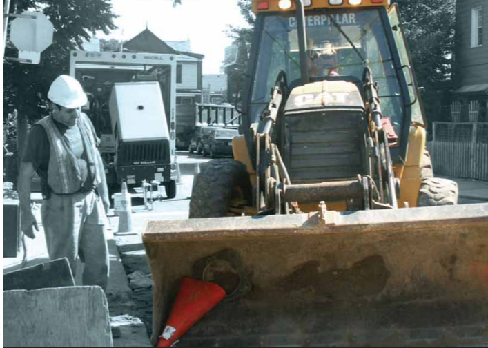
road excavation begins

Homes with a water service made from lead or other non-approved materials, or that is otherwise sub-standard (e.g. size smaller than 19 mm (3/4 inch), not providing adequate water pressure/flow, etc.) qualify for replacement under the Lead Pipe Replacement Program.