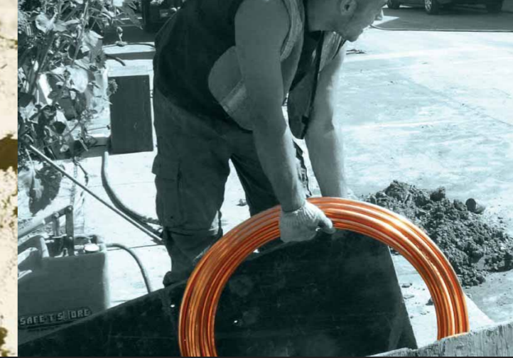
19 mm coil pipe replacement