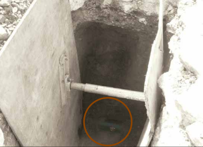
excavation over watermain