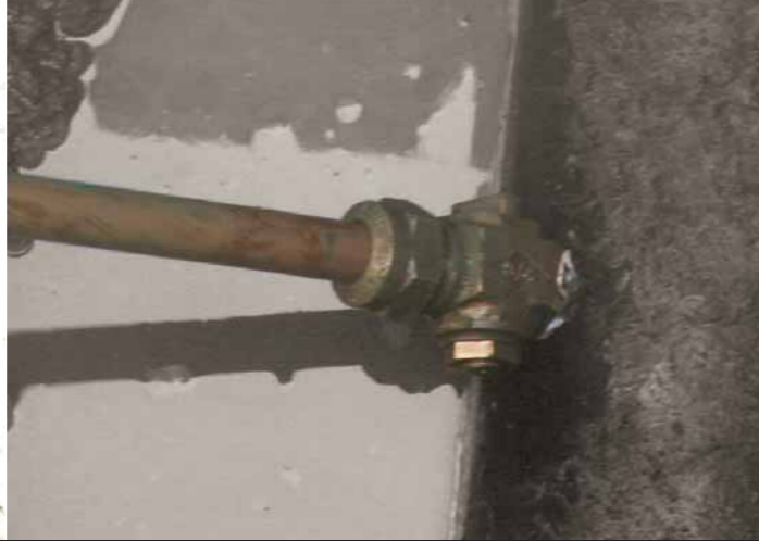
water service connection complete