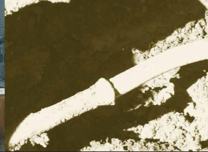
existing lead pipe